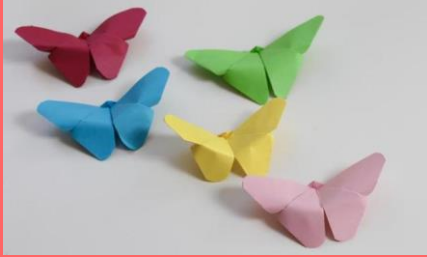
Fold Paper Butterflies