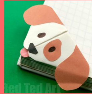
Dog Corner Bookmark